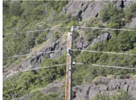
French Meadows Powerhouse and Switchyard to Hell Hole-Middle Fork Tunnel Gatehouse, Dormitory Facility, Operator Cottages and Hell Hole Powerhouse Communication Line/Powerline:

This photograph shows both insulated communication lines and an insulated and bundled three-phase powerline mounted on the same pole. This configuration does not represent a risk for avian electrocution.