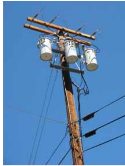
Ralston Afterbay Dam Generator Building to Ralston - Oxbow Tunnel Intake Communication Line/Powerline: This photograph shows an equipment pole with three metal transformers near the Hell Hole-Middle Fork Tunnel Gatehouse. This equipment pole design poses a potential risk for avian electrocution.