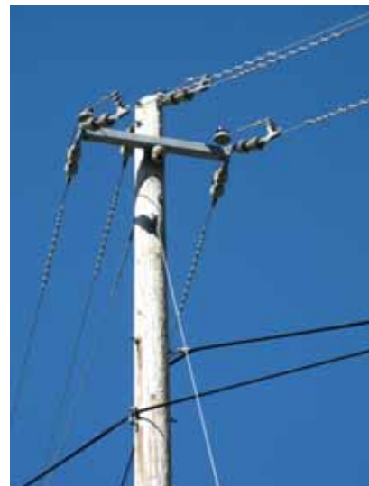
Hell Hole Powerhouse to Rubicon River Gage and Weir below Hell Hole Dam Communication Line/Powerline:

This photograph shows a portion of the powerline leading to the French Meadows Powerhouse that has uninsulated three-phase distribution lines with conductors mounted horizontally on crossbars. Note also the guy wires located in proximity to the phases. This configuration poses a potential risk for avian electrocution.