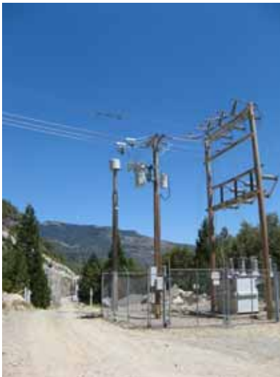
French Meadows Powerhouse and Switchyard to Hell Hole-Middle Fork Tunnel Gatehouse, Dormitory Facility, Operator Cottages and Hell Hole Powerhouse Communication Line/Powerline: This photograph shows a large equipment structure at the Hell Hole Substation. This equipment pole design poses a potential risk for avian electrocution.