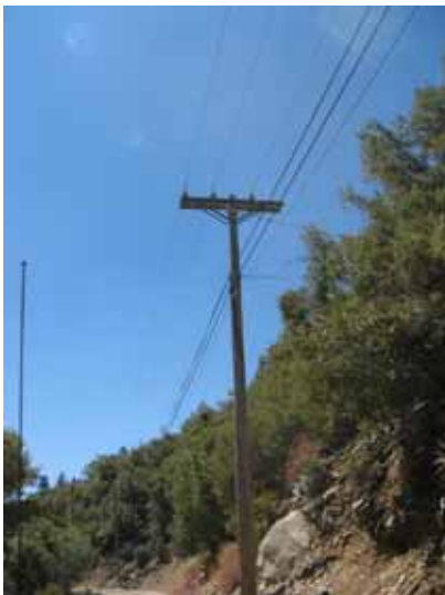
French Meadows Powerhouse and Switchyard to Hell Hole-Middle Fork Tunnel Gatehouse, Dormitory Facility, Operator Cottages and Hell Hole Powerhouse Communication Line/Powerline:

This photograph shows a portion of the powerline leading to the Hell Hole Powerhouse with uninsulated three-phase distribution lines and conductors mounted vertically on the poles (no crossarms). This configuration poses a potential risk for avian electrocution.