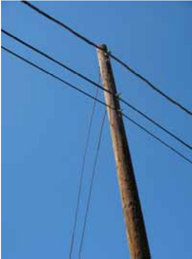
Oxbow Powerhouse to Ralston Afterbay Dam Generator Building Communication Line/Power Line:

This photograph shows both insulated communication lines and an insulated and bundled three-phase powerline mounted on the same pole. This configuration does not represent a risk for avian electrocution.