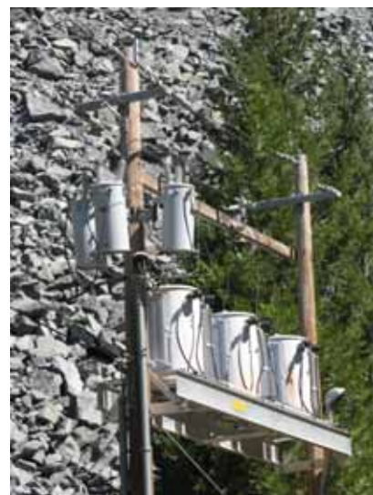
French Meadows Powerhouse and Switchyard to Hell Hole-Middle Fork Tunnel Gatehouse, Dormitory Facility, Operator Cottages and Hell Hole Powerhouse Communication Line/Powerline: This photograph shows a large equipment structure at the Hell Hole Powerhouse. This equipment pole design poses a potential risk for avian electrocution.