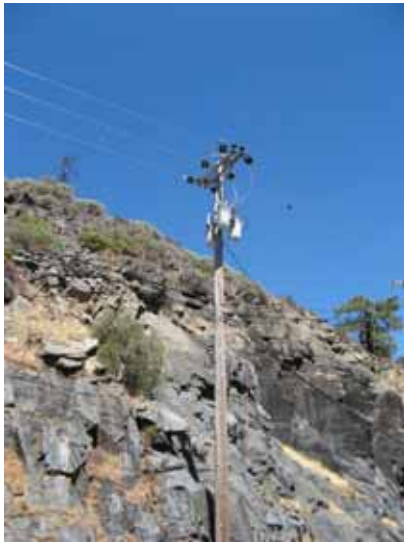
French Meadows Powerhouse and Switchyard to Hell Hole-Middle Fork Tunnel Gatehouse, Dormitory Facility, Operator Cottages and Hell Hole Powerhouse Communication Line/Powerline: This photograph shows an equipment pole with three metal transformers near the Hell Hole-Middle Fork Tunnel Gatehouse. This equipment pole design poses a potential risk for avian electrocution.