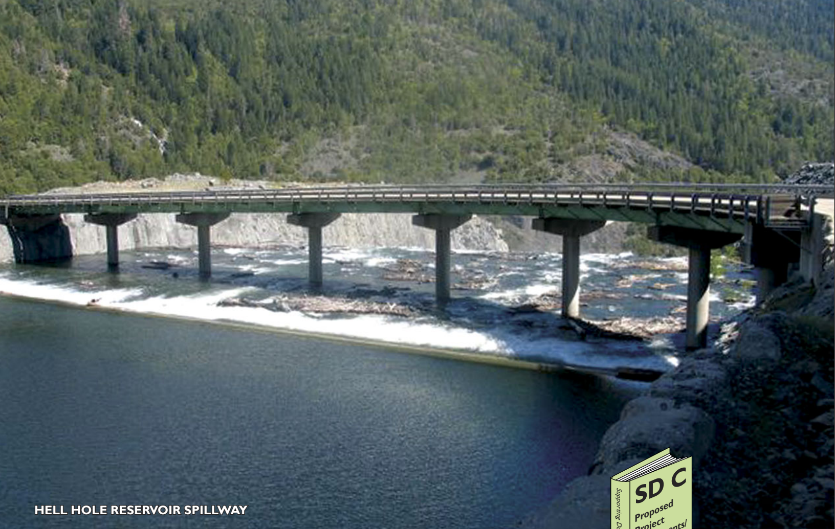
HELL HOLE RESERVOIR SPILLWAY