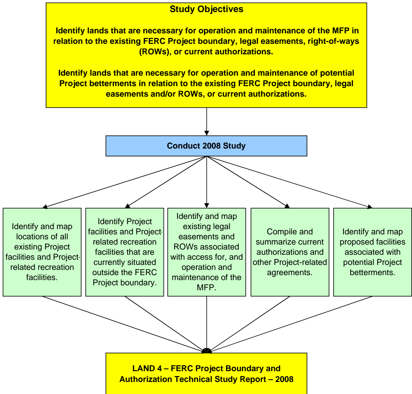
Figure LAND 4-1. FERC Project Boundary and Authorization Objectives and Related Study Elements and Reports.