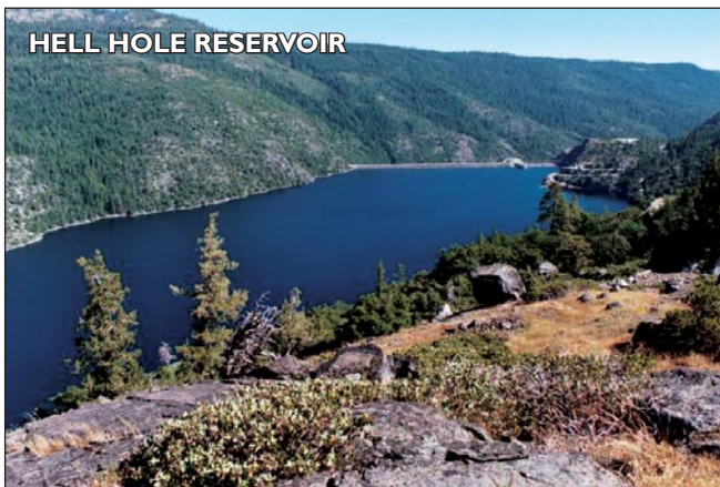
Installation of spillway gates on Hell Hole Reservoir will increase seasonal storage and power generation.

The purpose of this betterment would be to seasonally increase the storage capacity of Hell Hole Reservoir. The betterment would utilize a portion of the existing flood control pool, above the present normal maximum operating water level, to store additional water during the spring and summer after the peak of the runoff period. An approximate 9,750 ac-ft to 12,000 ac-ft increase in seasonal storage in the reservoir would be achieved by installing 8-10 foot high crest gates on the existing dam spillway. The crest gates would be raised when needed to increase reservoir storage. Operation of the crest gates would also seasonally increase the reservoir's inundation area within the existing flood pool by approximately 37 acres.