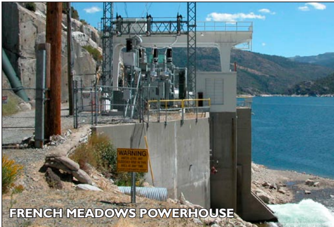
FRENCH MEADOWS POWERHOUSE

The addition of a second French Meadows Powerhouse will allow PCWA to increase peaking generation.