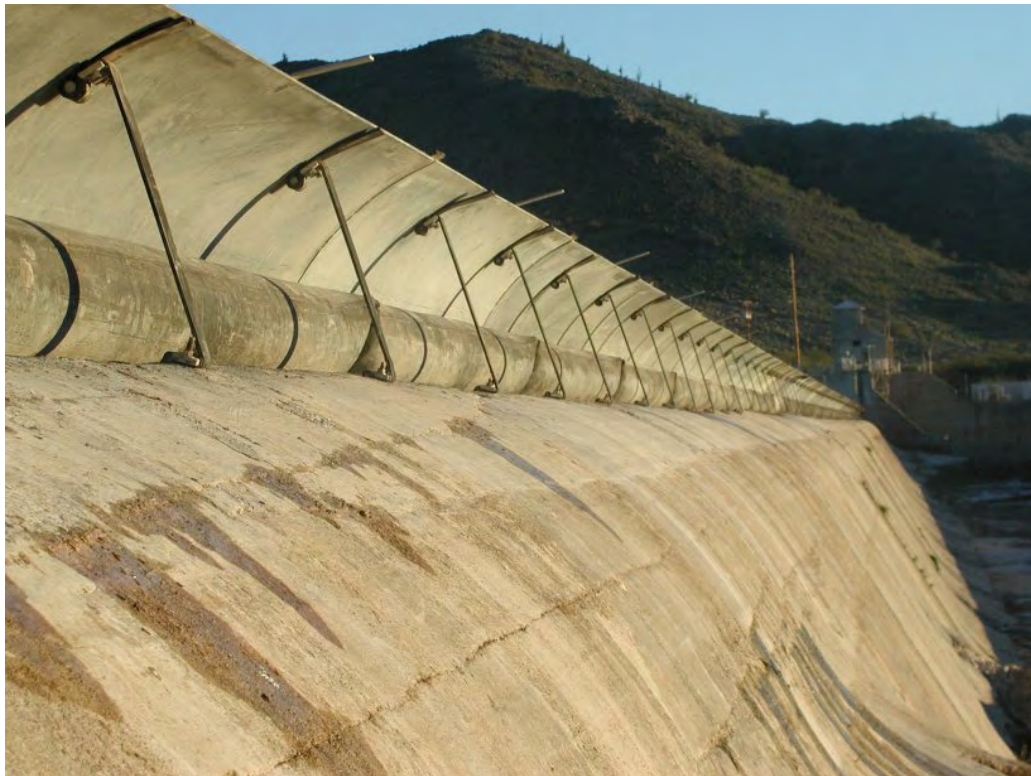
Figure SD C-2. Proposed Spillway Crest Gates - Example