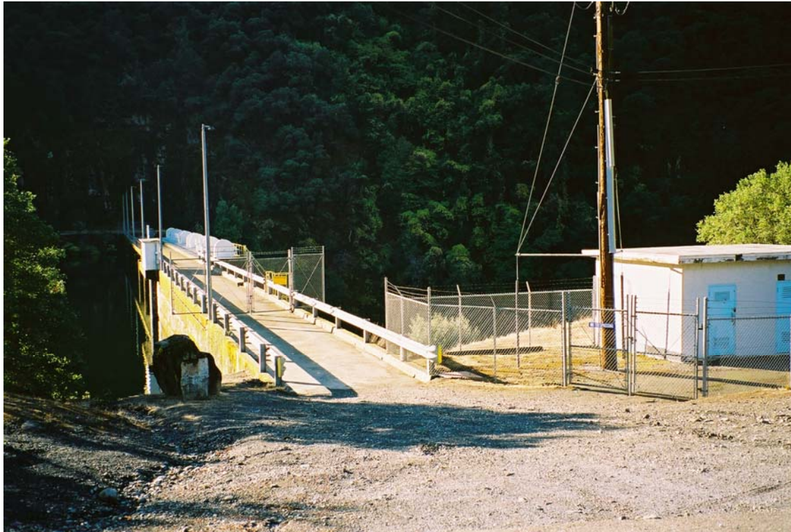
Photo M-3. View of safety railing across Ralston Afterbay Dam and perimeter fencing around the Ralston Afterbay Dam Generator Building. Also note locked fence and gate to prohibit access to dam.