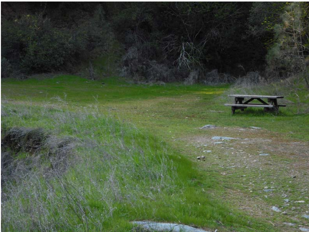
Photo U-2-2. The lack of use of the parking/turnaround area has allowed for vegetation overgrowth. (3/12/09)