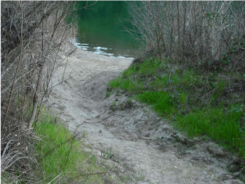
Photo U-2-5. Trail leading to river from end of Drivers Flat Road. (3/12/09)