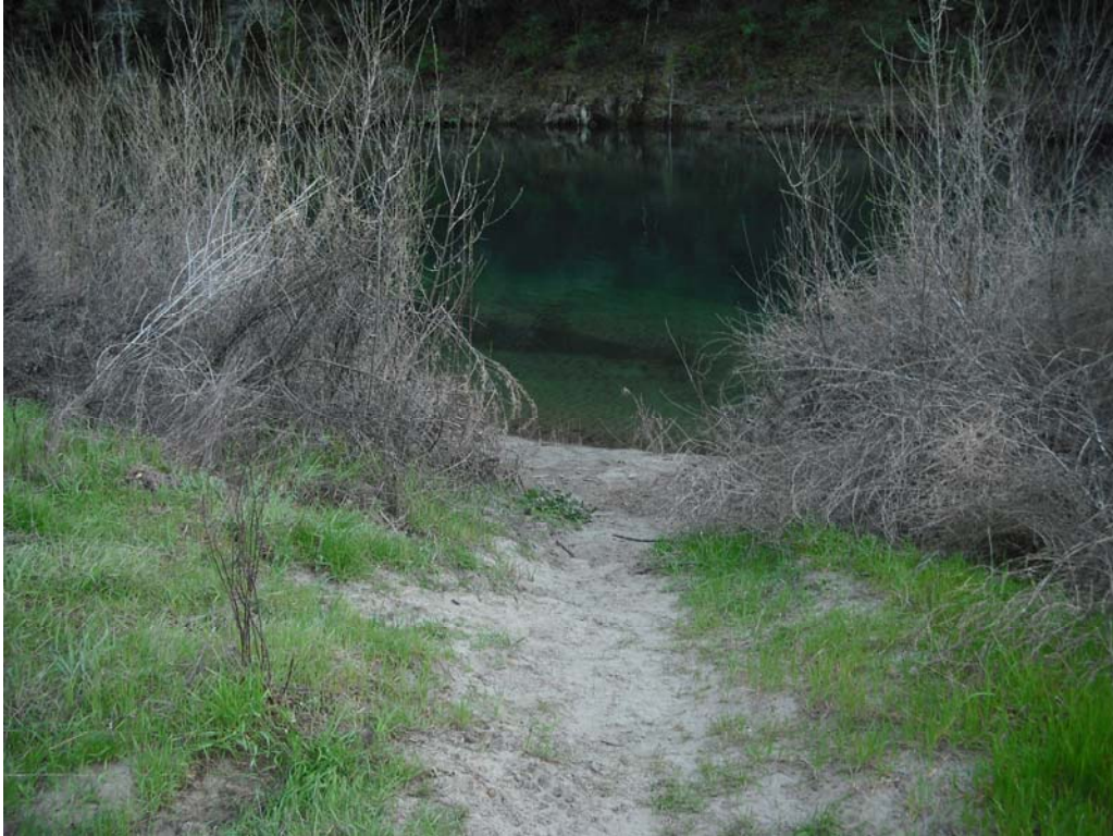
Photo U-2-7. Trail between beach and bathroom to beach area. (3/12/09)