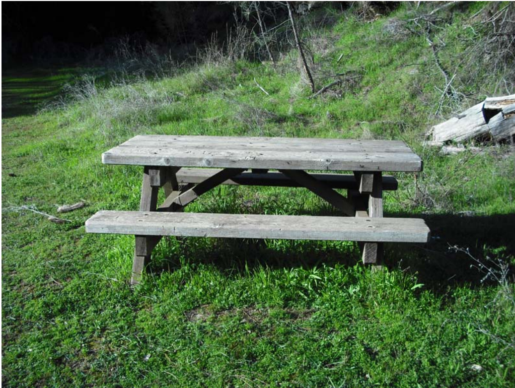
Photo U-2-3. Picnic table located on the east side of the parking/turnaround area. (3/12/09)