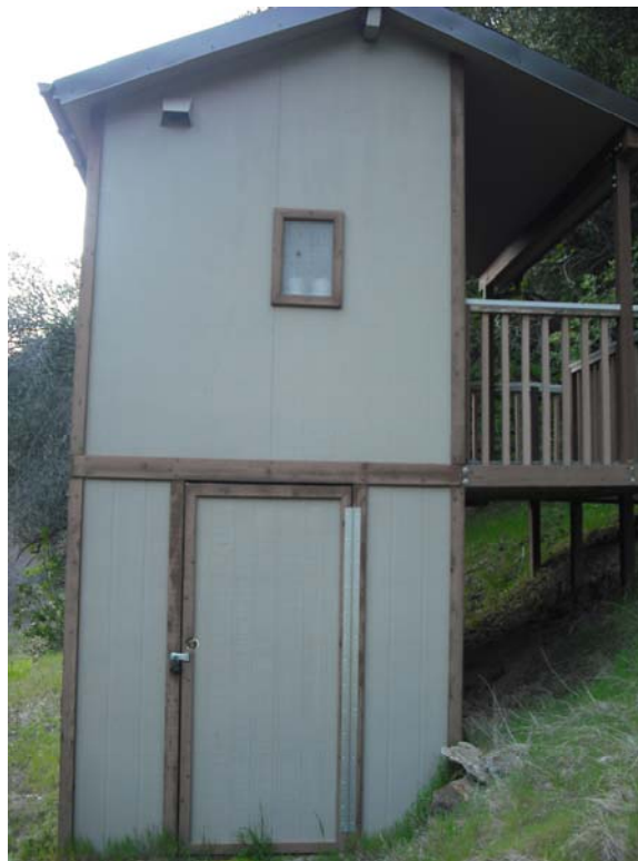
Photo U-2-6. Compost toilet located on the east side of the facility. (3/12/09)