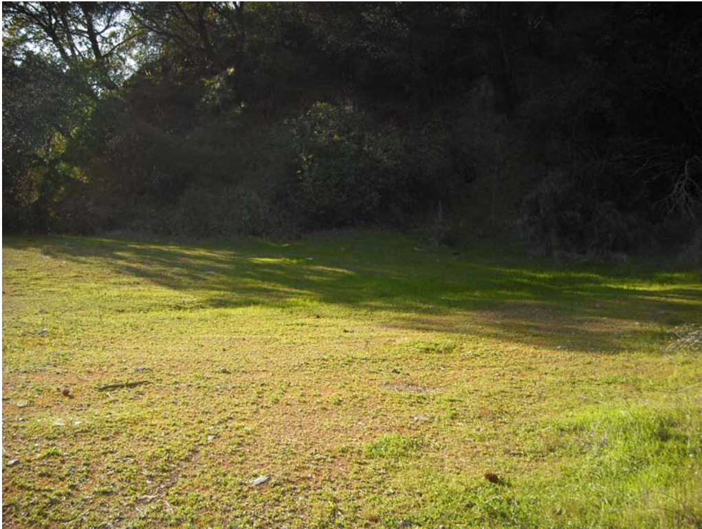
Photo U-2-1. The parking/turnaround area located on the northwest side of Canyon Creek. (3/12/09)