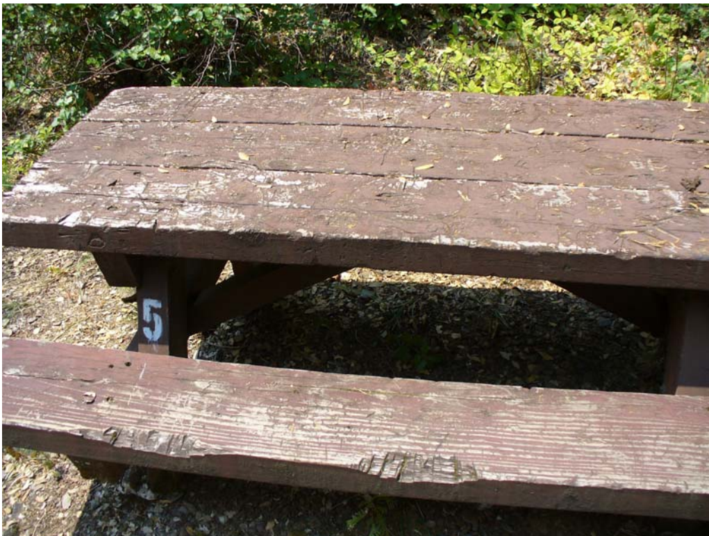
Photo S-2-6. Site 5 picnic table. Table is in poor condition and does not meet accessibility standards.