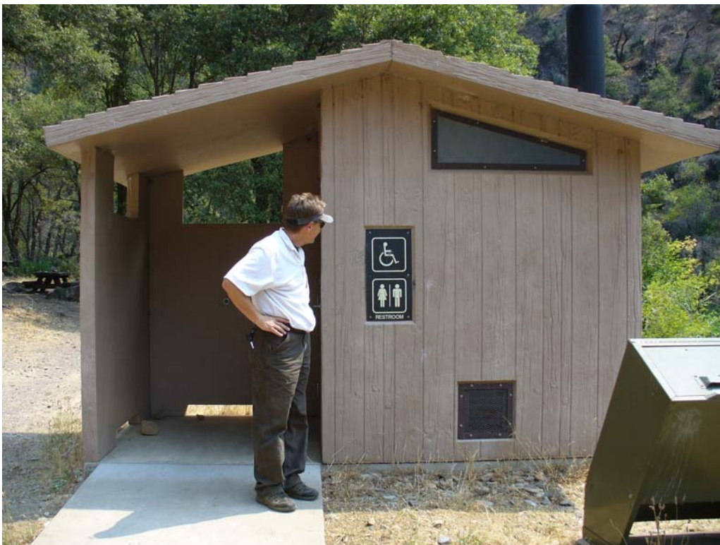
Photo S-2-4. Single unit, pre-fabricated concrete toilet (CXT) at Ralston Picnic Area. (7/23/08)