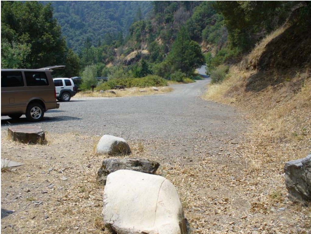
Photo S-2-3. Parking area and entrance road as viewed from bathroom. (7/23/08)