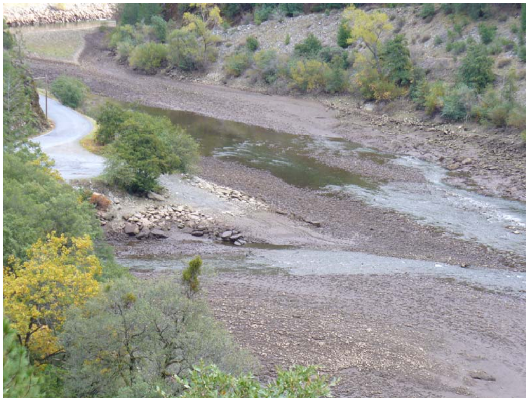
Photo S-2-10. Sediment removal access point on Ralston Afterbay. This site is not a Project recreation facility but is sometimes used to access the reservoir. (11/12/08)