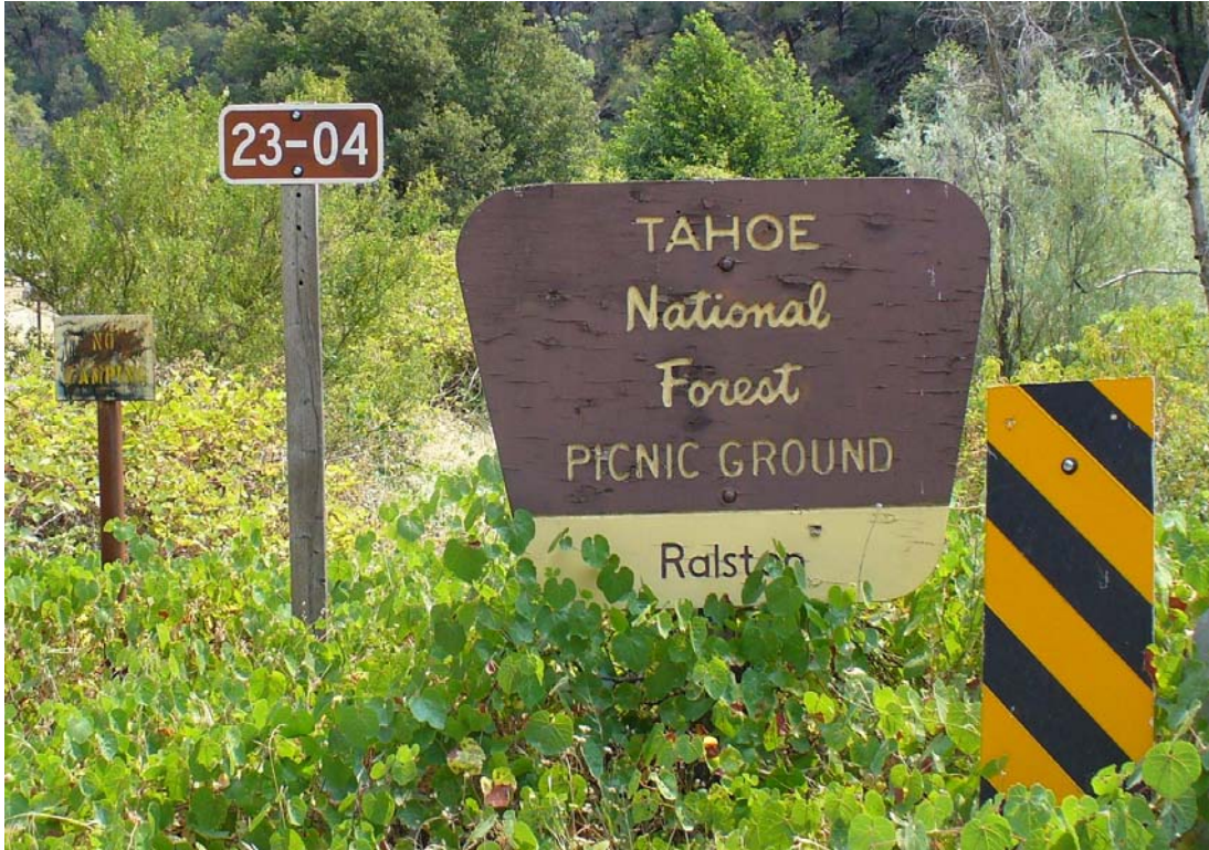
Photo S-2-1. Site Identification sign and other signs at entrance to Ralston Picnic Area. (7/23/08)