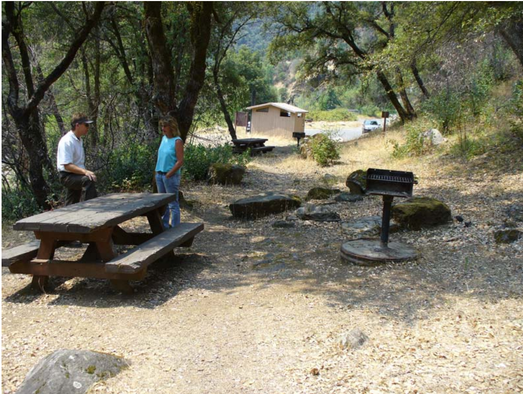
Photo S-2-5. Typical picnic sites at Ralston Picnic Area (Site 4 in foreground, Site 3 in background). These sites are not considered disabled accessible due to insufficient clear space, obstacles, and level changes. In addition, the tables and grills are not accessible.