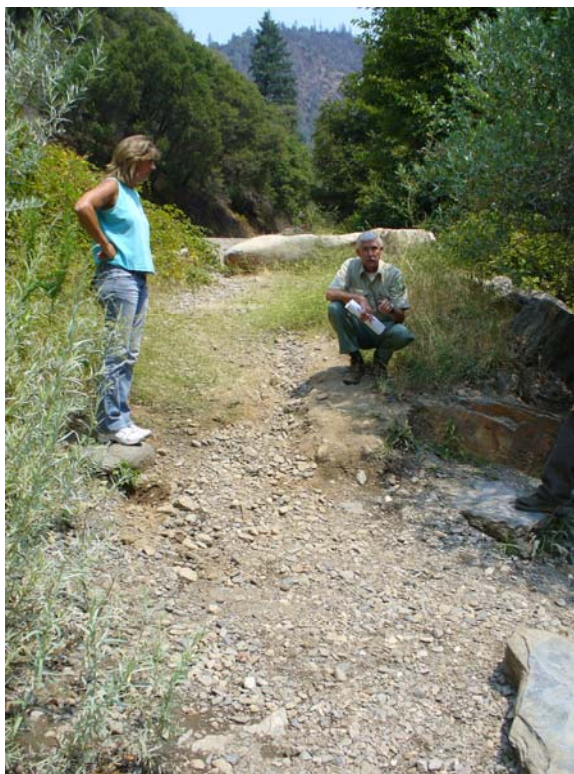
Photo S-2-9. Close up of Ralston Car Top Boat Ramp Note large rock in center of ramp. (7/23/08)