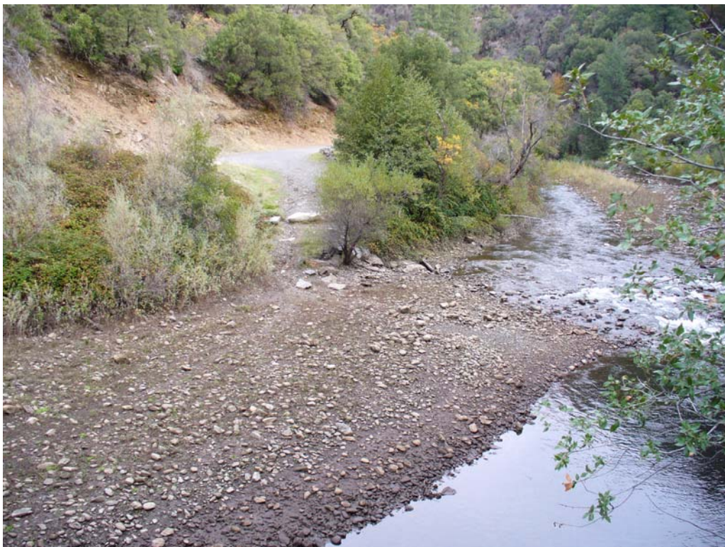
Photo S-2-8. Ralston Car Top Boat Ramp on November 12, 2008 at 10:33 A.M. This photograph was taken during PCWA's annual maintenance outage when the reservoir WSE was about 1,155 feet. Note the large rock in center of ramp.