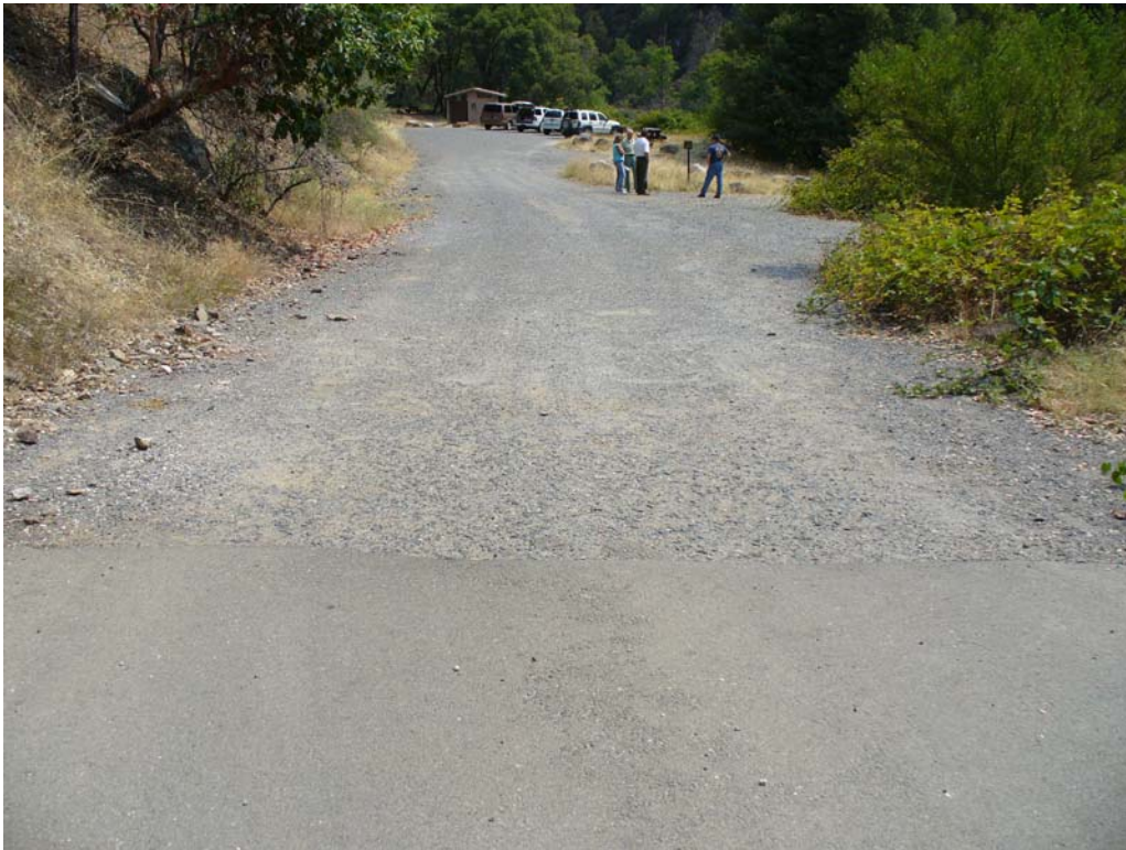
Photo S-2-2. Entrance to Ralston Picnic Area and Car Top Boat Ramp. (7/23/08)