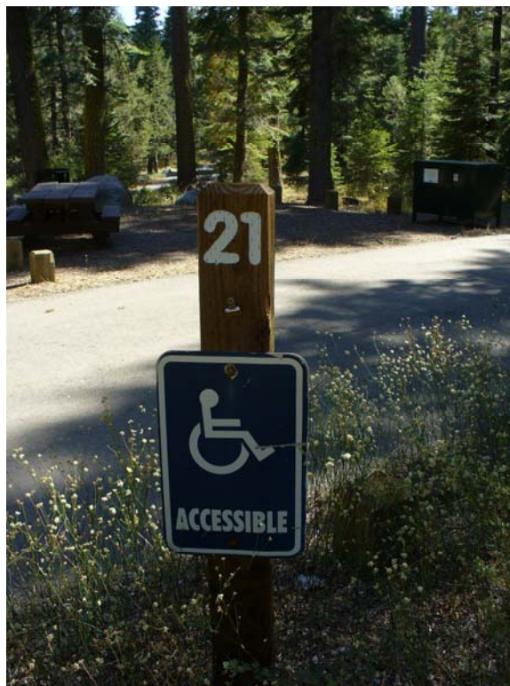
Photo K-2-19. Designated accessible camp site. This type of sign is also present at Sites 4 and 19. (9/04/08)