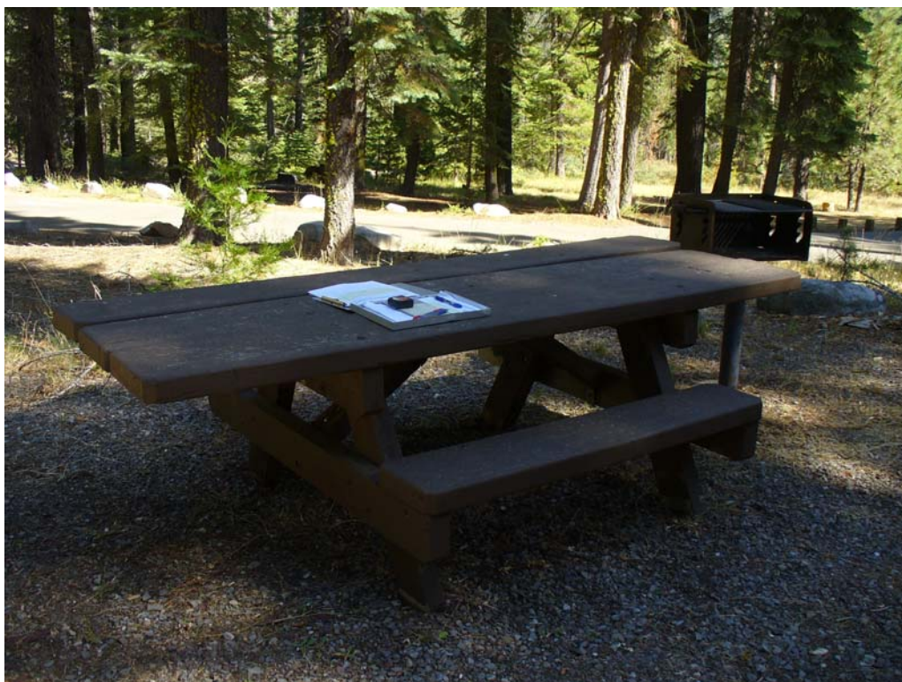
Photo K-2-20. Accessible heavy wood table and pedestal grill at accessible Site 21. Note clear space around table and level, crushed rock surface. (9/04/08)