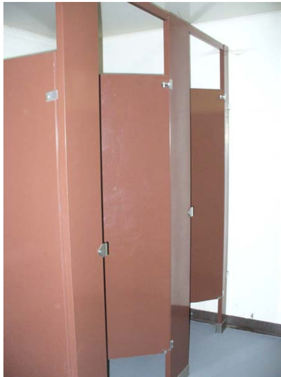
Photo K-2-14. Stalls inside of wood bathroom. These stalls are not accessible but this type of bathroom can be converted to meet accessibility standards. (9/04/08)