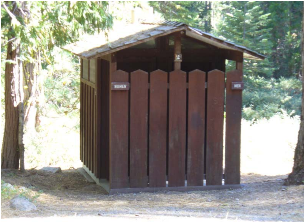
Photo K-2-10. Wood bathroom structure No. 2. This is a double unit vault toilet in fair condition. Not accessible. (9/04/08)