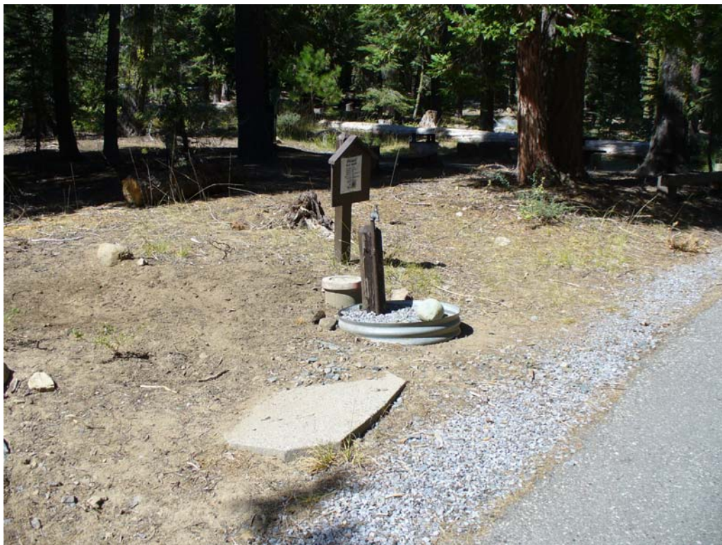
Photo K-2-8. Typical water faucet and information board located along loop roads, not accessible. (9/04/08)