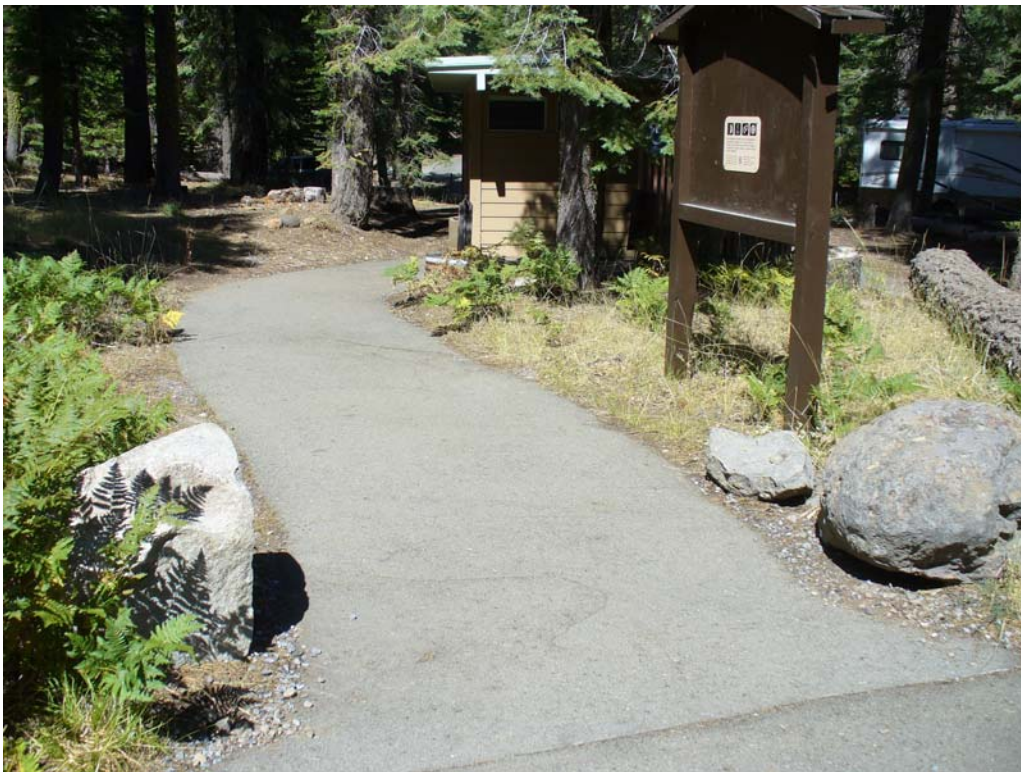
Photo K-2-6. Paved accessible pathway to accessible bathroom with information board, adjacent to host site. All in good condition. (9/04/08).