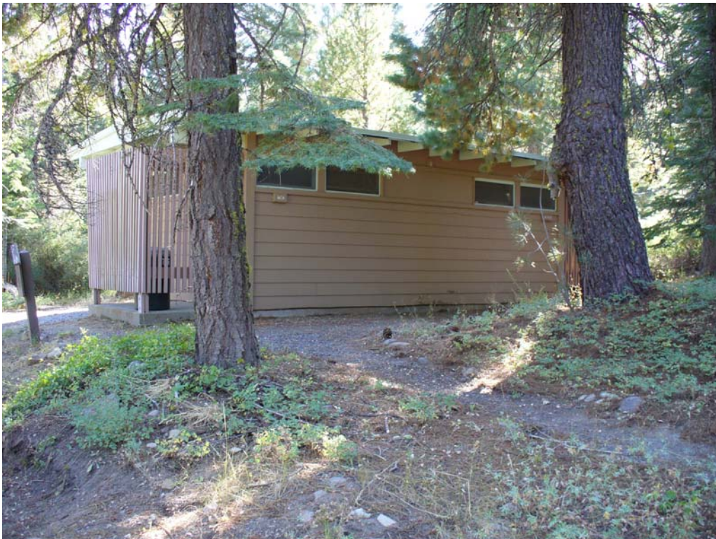
Photo K-2-12. Wood bathroom structure with flush toilets and sinks, not accessible. (9/04/08)