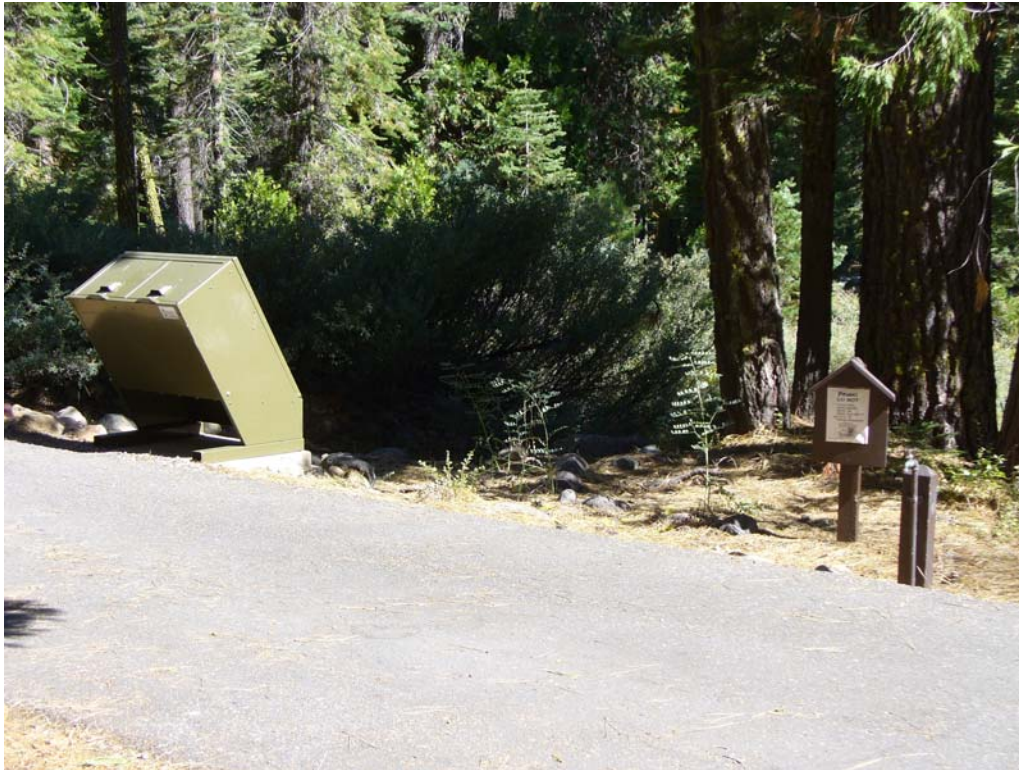
Photo K-2-9. Typical 2-bin, bear-proof garbage container, new and in good condition. Note water faucet and information board on right side of photograph. Faucet is not accessible. (9/04/08)