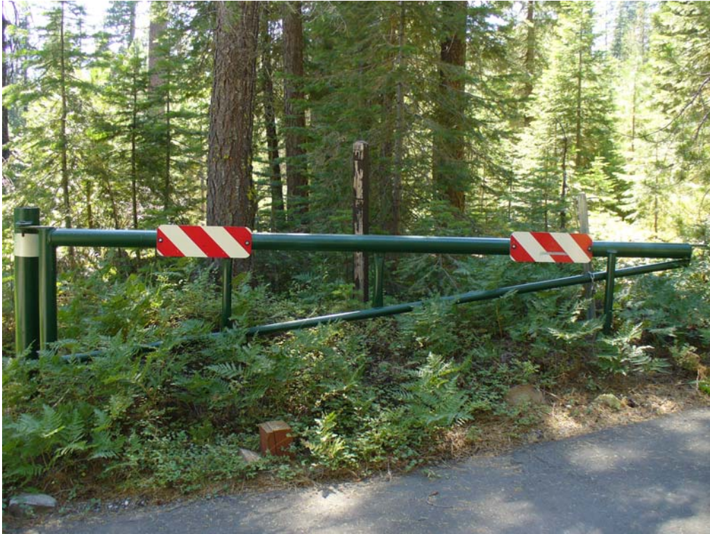
Photo K-2-3. Swing gate with reflective hazard signs located at entrance to Lewis Campground, good condition. (9/04/08)