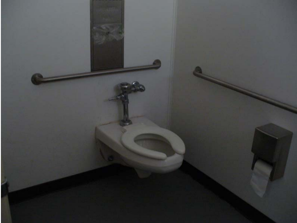
Photo K-2-18. Inside of wood bathroom structure converted to meet accessibility standards. (9/04/08)