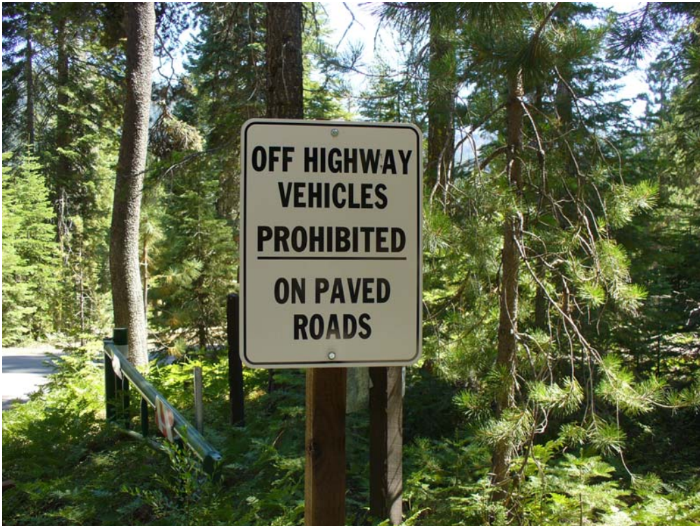
Photo K-2-2. Signage at Lewis Campground exit, good condition. (9/04/08)