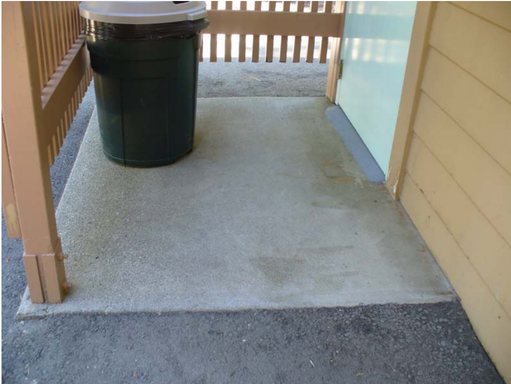
Photo K-2-17. Accessible approach to bathroom. Note the absence of level changes. (9/04/08)