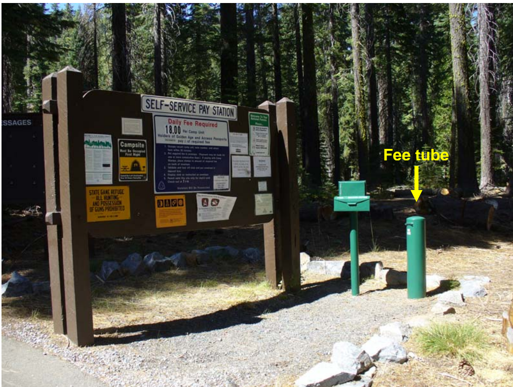
Photo K-2-4. Fee station at Lewis Campground located near entrance, all in good condition. (9/04/08)