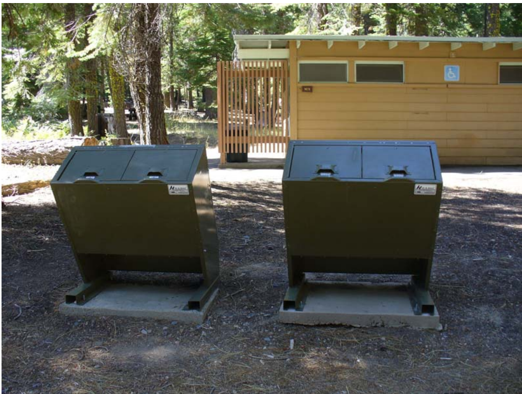
Photo K-2-16. Bear-proof garbage bins on concrete pads. Wood bathroom structure in background has flush toilets and has been converted to meet accessibility standards. (9/04/08)