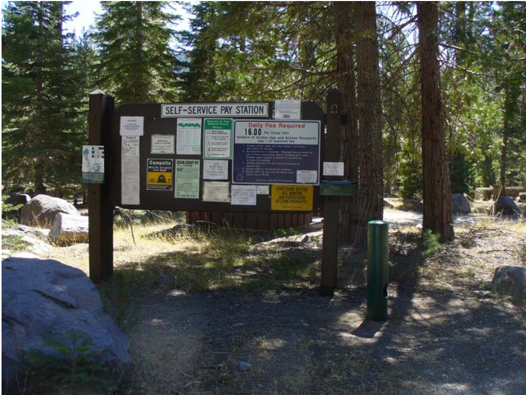
Photo I-2-3. Fee station near entrance to Ahart Campground. Fee tube to right of information board. (9/04/08)