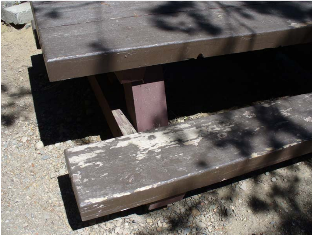
Photo I-2-11. Typical heavy wood table showing flaking paint. (9/04/08)