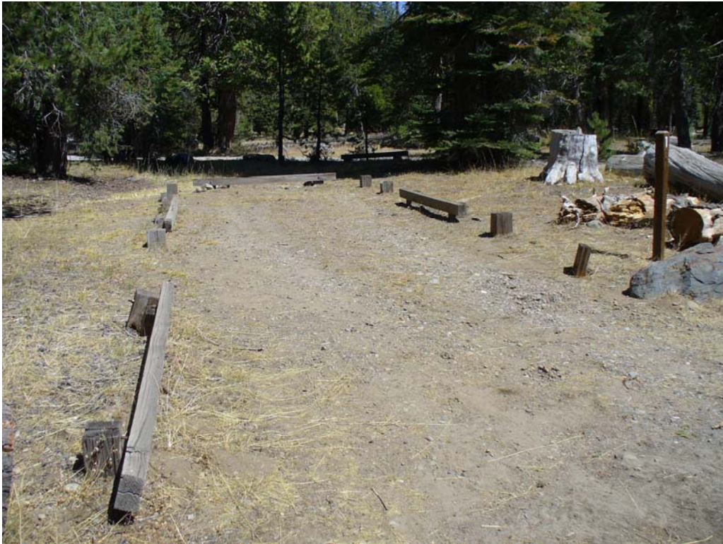
Photo I-2-5. Typical parking spur delineated with wood posts and barriers. Note native surface. (9/4/08)