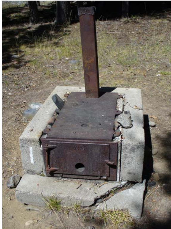
Photo I-2-7. Concrete and steel stove at site 1, poor condition. (9/04/08)