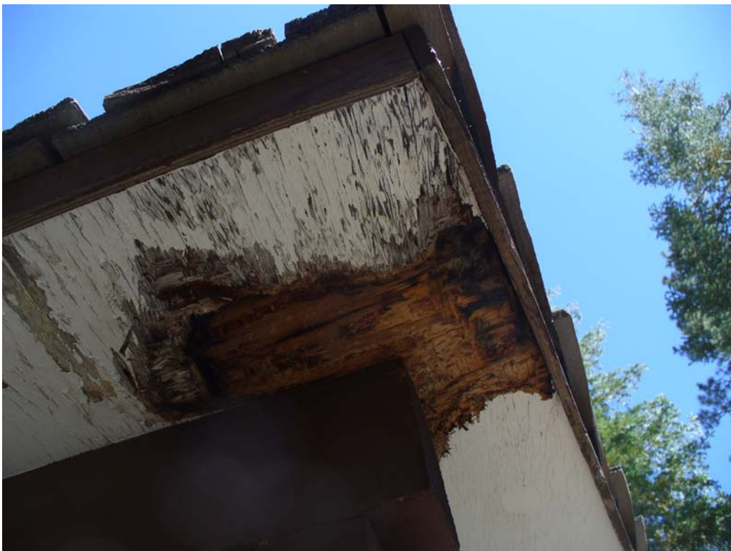
Photo I-2-14. Dry rot on roof and frame of toilet building No. 1. (9/0408)