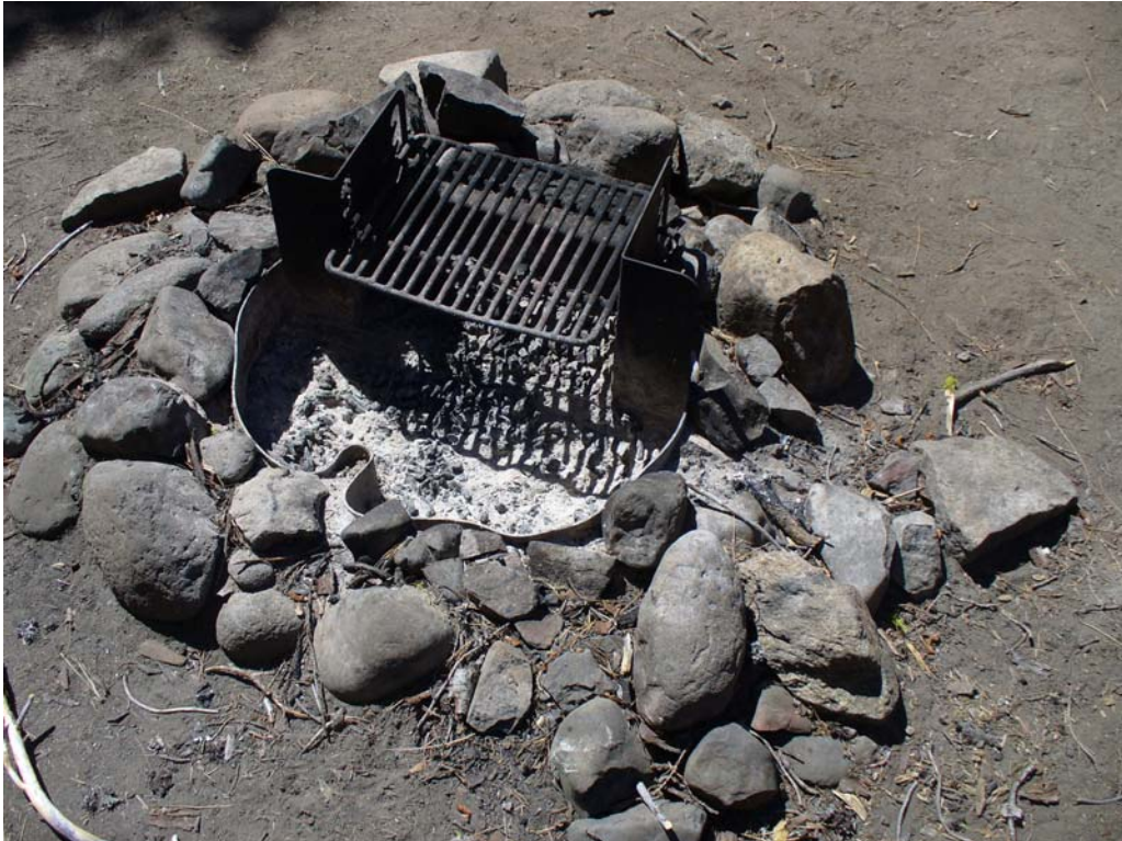
Photo I-2-10. Steel fire ring and grill, poor condition. (9/04/08)