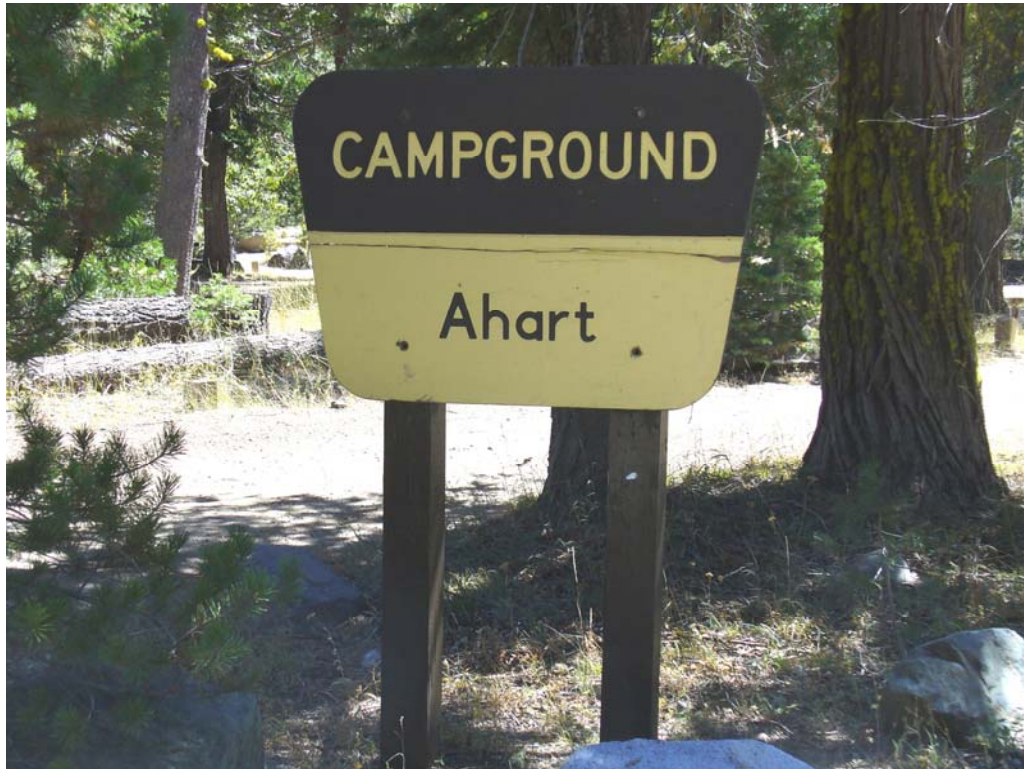
Photo I-2-2. Site identification sign at entrance to Ahart Campground. This site is in fair condition due to the large crack. (9/04/08)