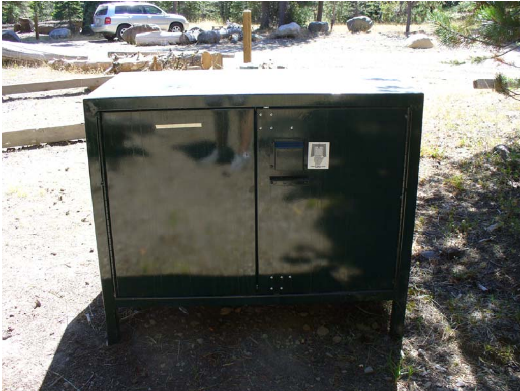
Photo I-2-9. Typical bear-proof food storage locker (bear box), new and in good condition. (9/04/08)