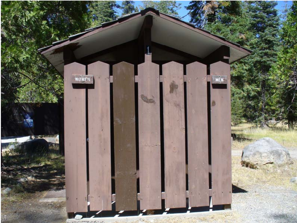
Photo I-2-13. Double-unit, vault toilet building (No. 1). (9/04/08)