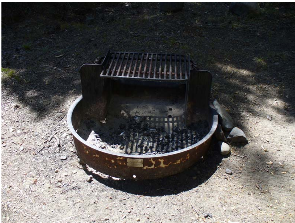
Photo I-2-8. Typical steel fire ring with grill, not accessible. (9/04/08)