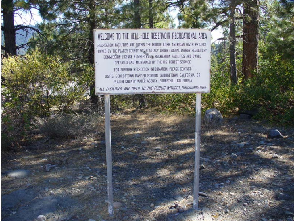
Photo G-2-1. Information sign located near the southern boundary of Hell Hole Vista parking area. This sign is required by CFR 18 Part 8. (8/20/08)