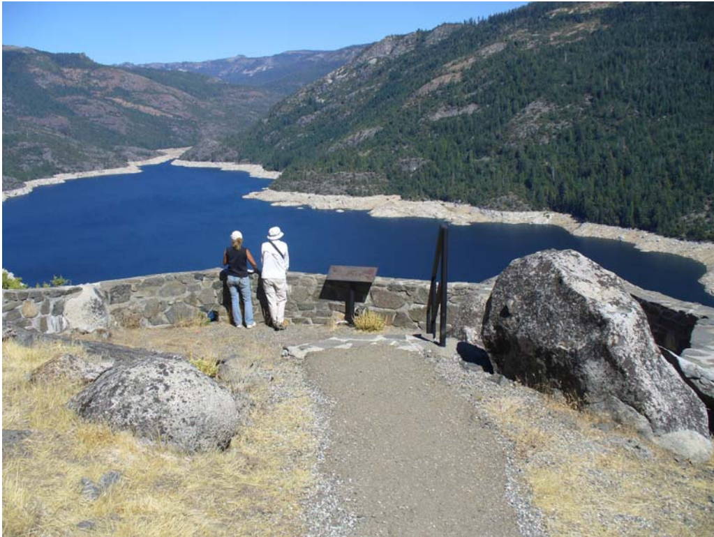
Photo G-2-9. Hell Hole Vista with Hell Hole Reservoir in background. (8/20/08)