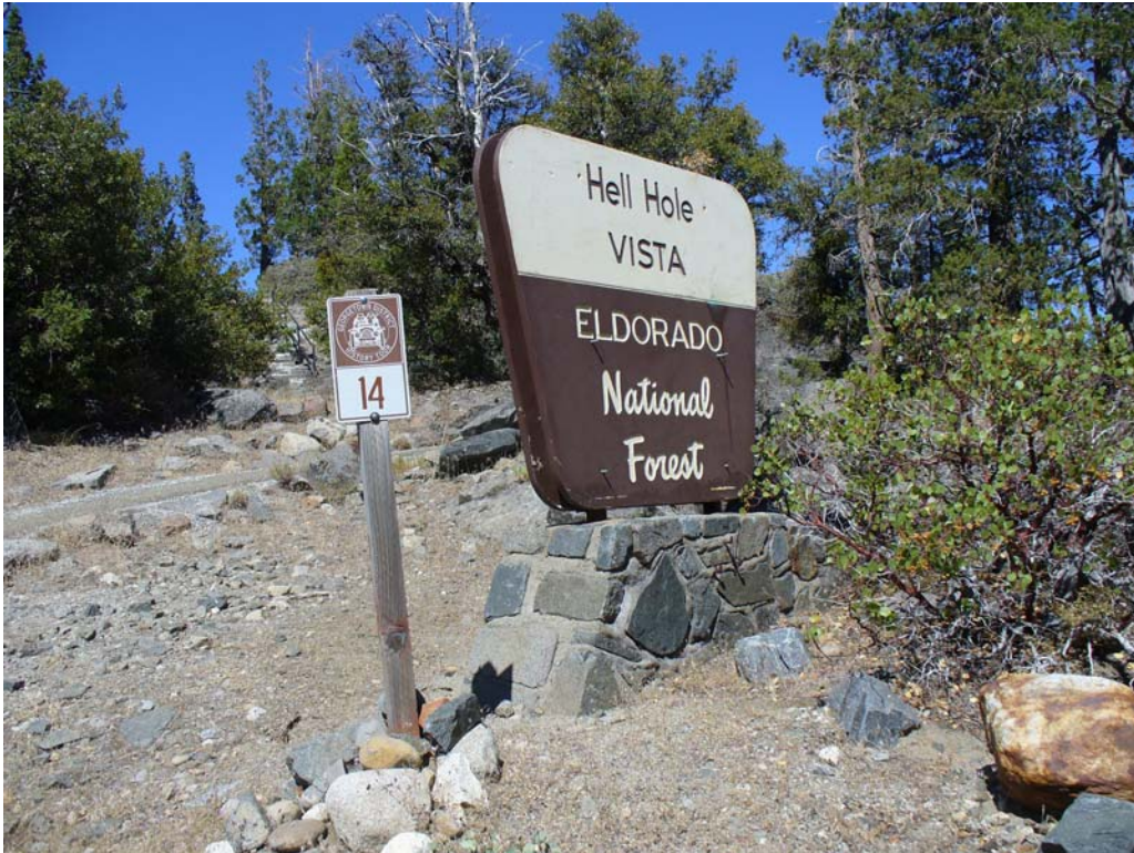
Photo G-2-5. Site Identification and History Tour signs located at entrance to trail to Hell Hole Vista. (8/20/08)