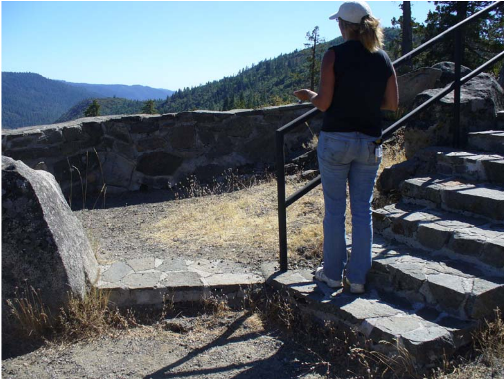
Photo G-2-11. Surface and level changes in Hell Hole Vista. (8/20/08)