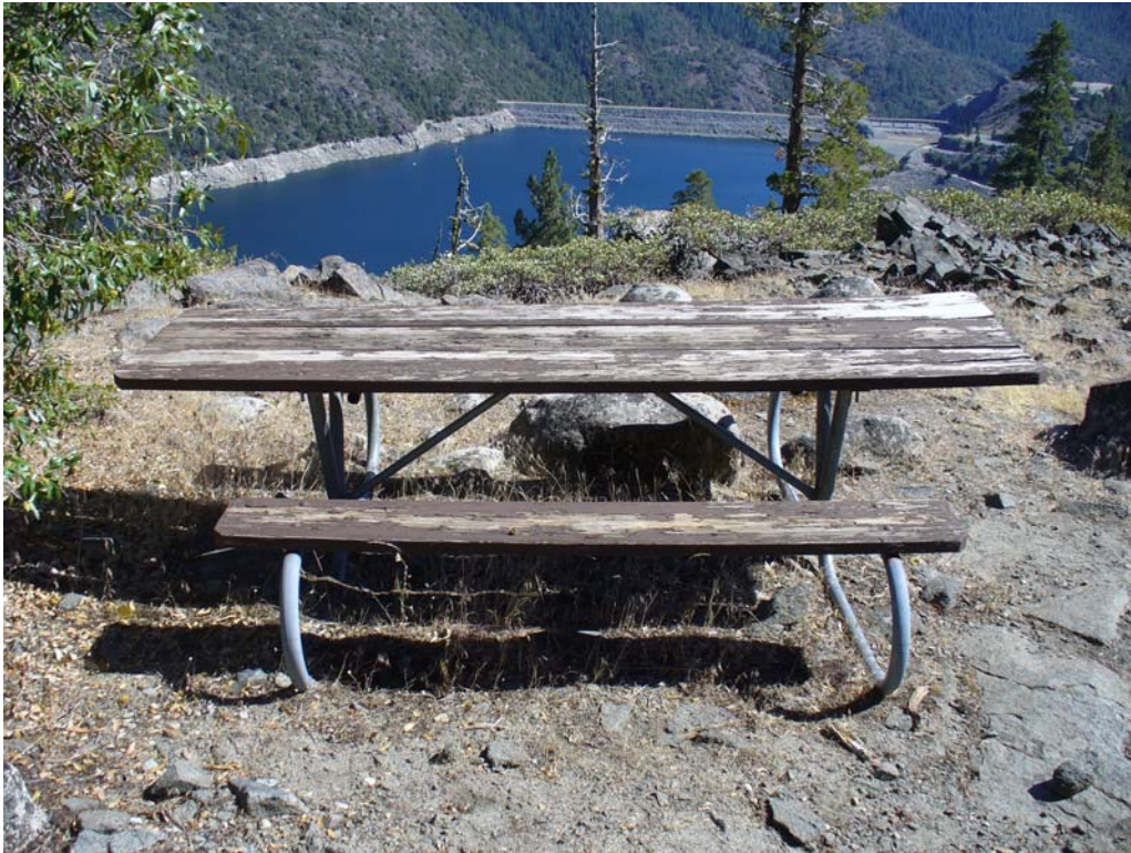
Photo G-2-7. Picnic table located along trail to Hell Hole Vista. Hell Hole Reservoir and Dam in background. (8/20/08)