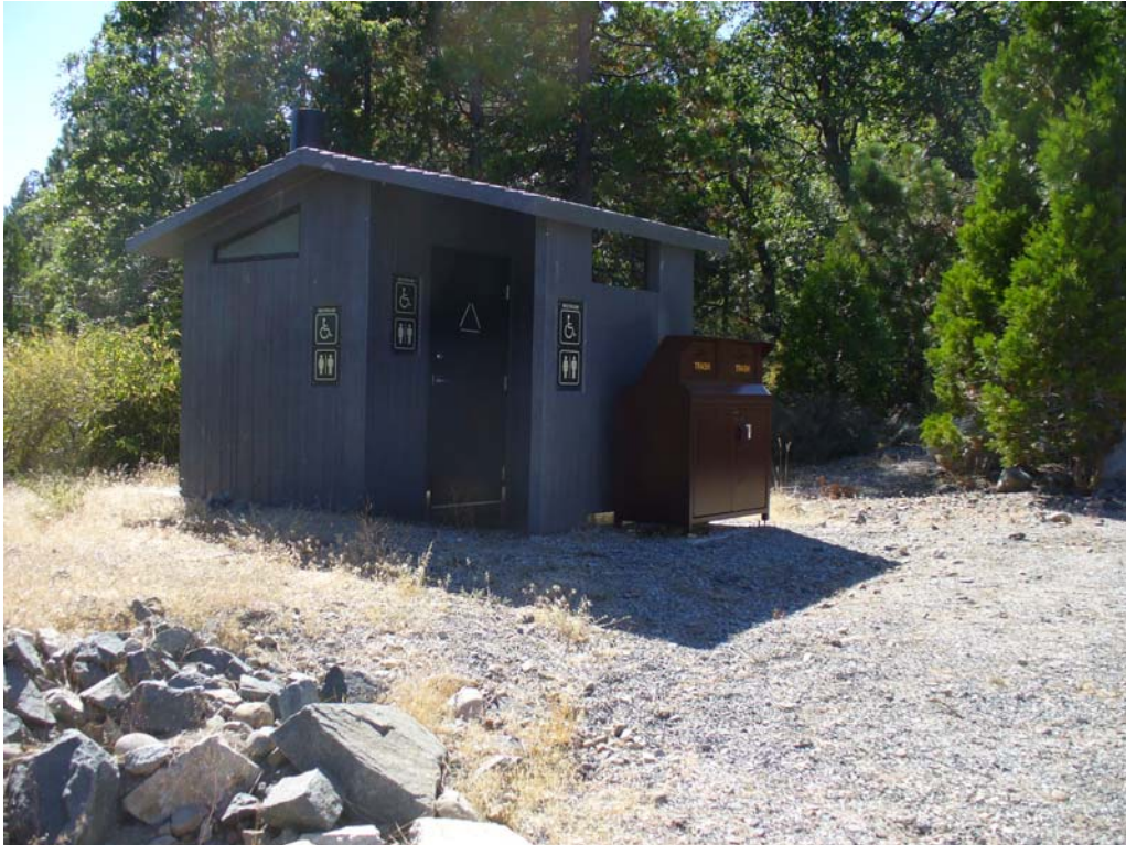
Photo G-2-4. Single-unit vault pre-cast concrete toilet (CXT) and double-bin bear-proof garbage container located in Hell Hole Vista parking area. (8/4/08)