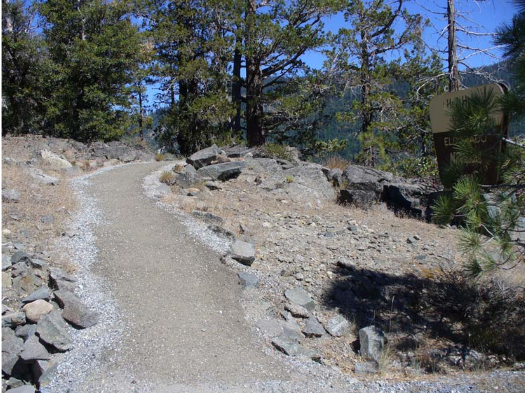
Photo G-2-6. Paved trail to Hell Hole Vista near entrance. (8/20/08)