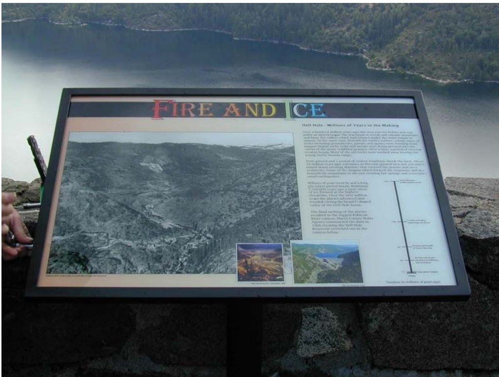
Photo G-2-12. Interpretive sign at Hell Hole Vista. This sign was installed in May 2009.