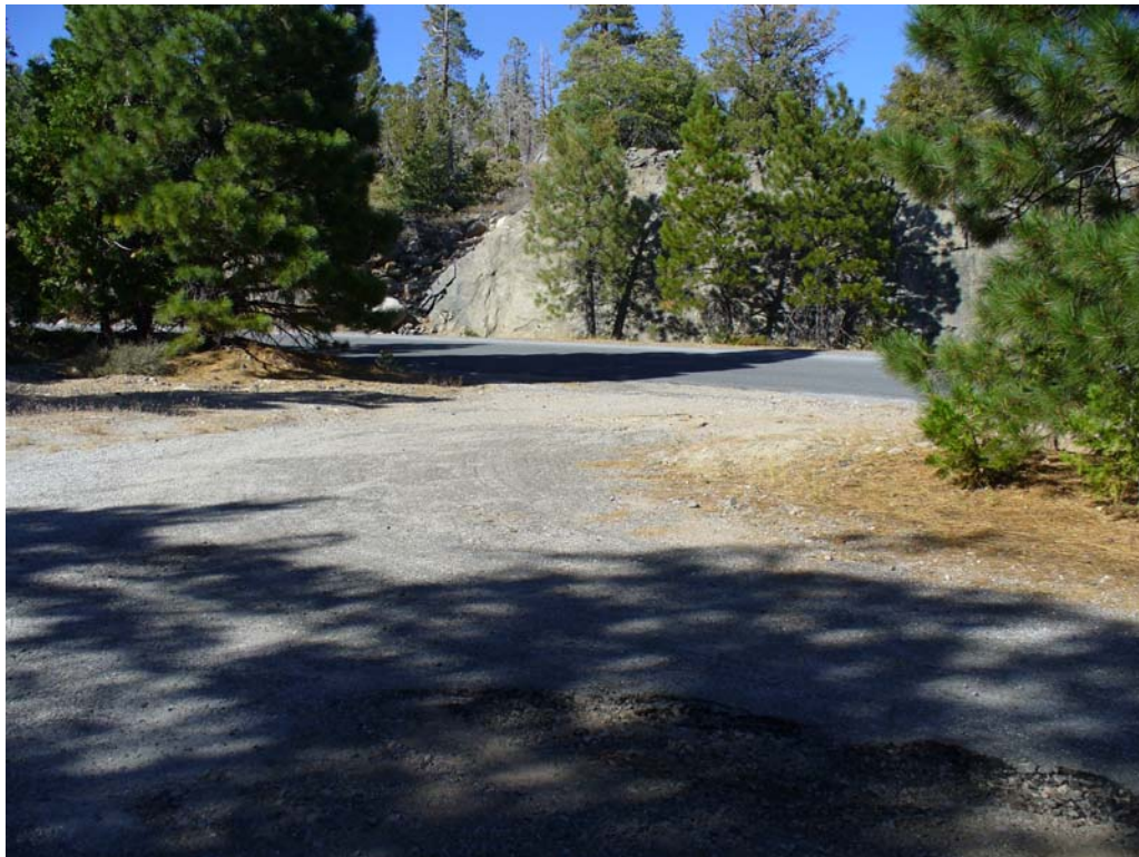
Photo G-2-2. Entrance to Hell Hole Vista Parking area. Roadway in background is FR-2. (8/20/08)