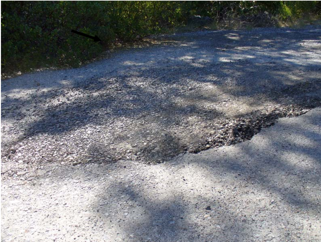
Photo G-2-3. Example of damaged pavement surface in Hell Hole Vista Parking area. (8/20/08)